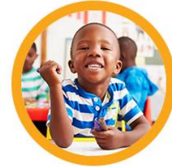
Make Time for America for Early Ed!