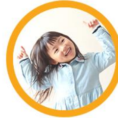
Take Action With America for Early Ed!