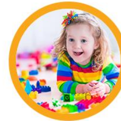
News Around Early Childhood Education