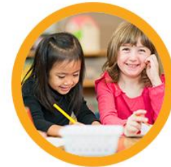
Connecting with America for Early Ed