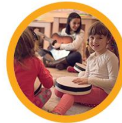
Actions & Resources for Early Childhood Education Advocacy