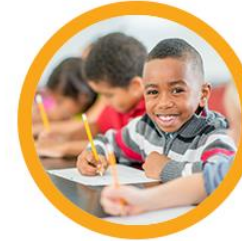
Your Advocacy Matters